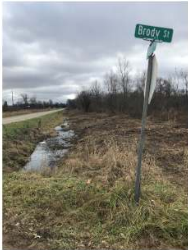
Mud & Pine Lake Drain- Marcellus Township