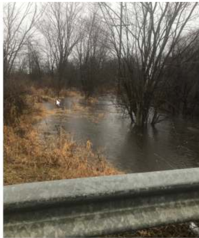
Flooding – Brandywine Drain