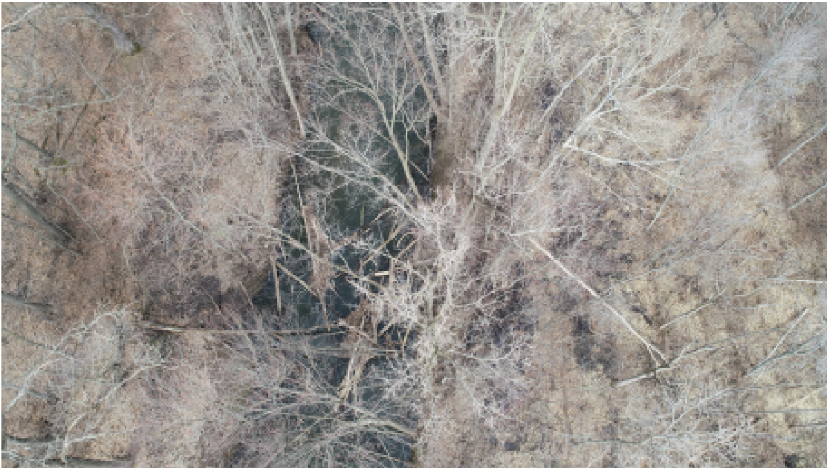
Dowagiac River Intercounty Drain – Drone Picture