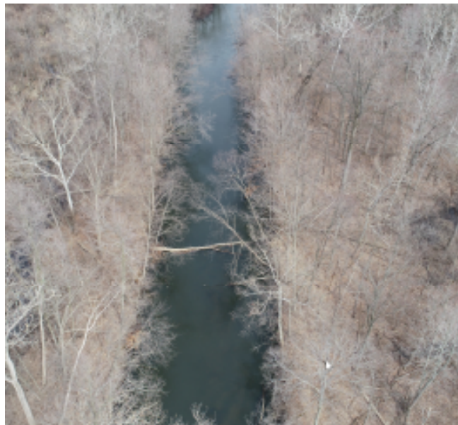
Dowagiac River Intercounty Drain – Drone Picture