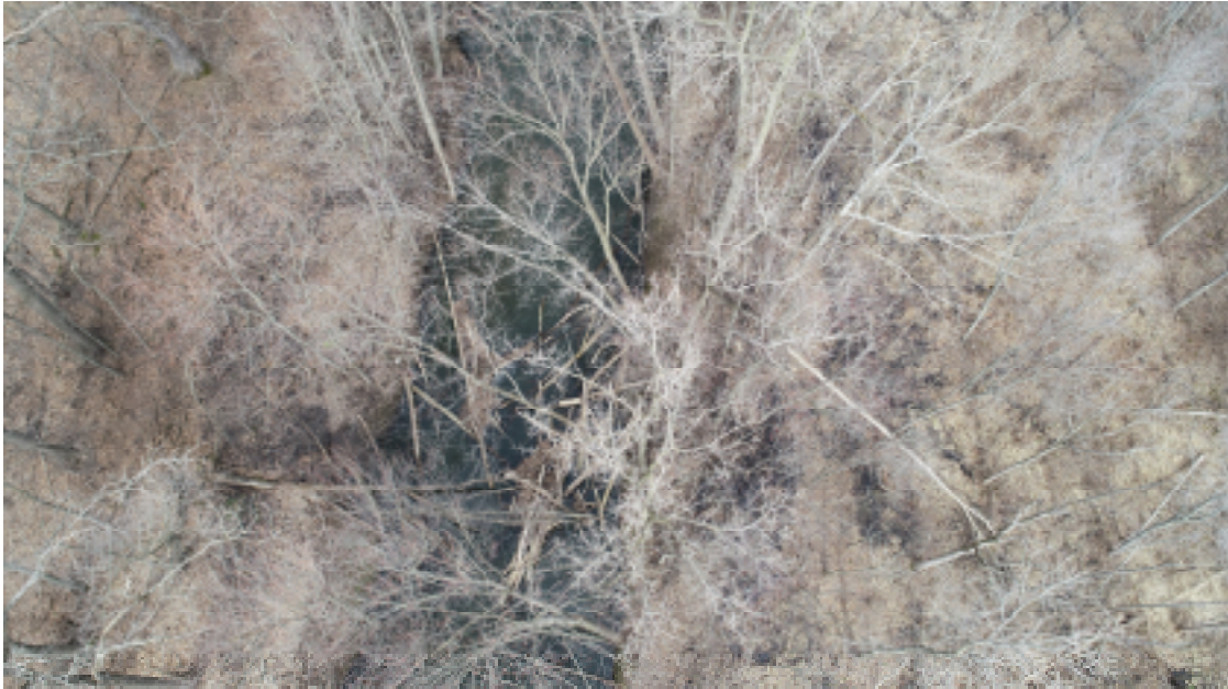
Dowagiac River Intercounty Drain – Drone Picture